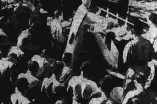
Troops board a Coast Guard manned transport en route to Makin for invasion of the Jap-held base...

Federal Operation Of Railroads Prospects New Offer by 15 Non-Operating Unions Adds Dash of Uncertainty To Labor Dispute.