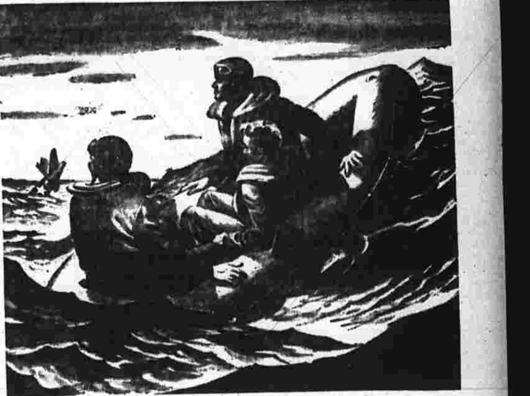
English Channel—Christmas, 1943