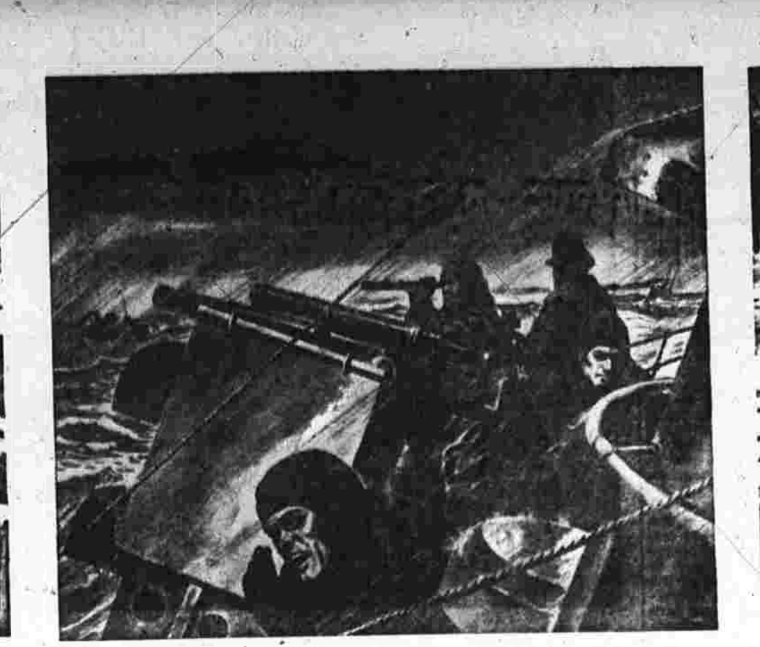
North Atlantic—Christmas, 1943