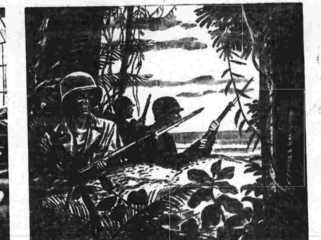
South Pacific—Christmas, 1943